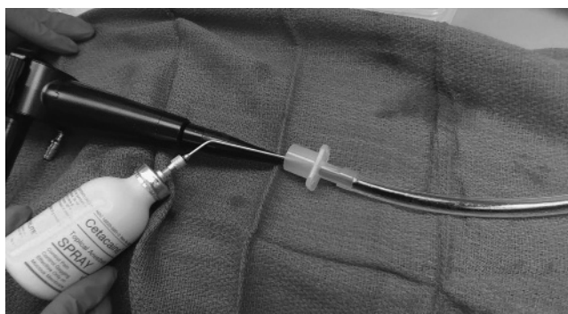
FIGURE 2. Cetacaine Spray can also be utilized as a lubricant for fiberoptic and bronchoscopic procedures.

Furthermore, assessment for the signs and symptoms of methemoglobinemia should always be made when using this medication. These include cyanosis, chocolate colored blood, and central nervous system changes. Also, values for oxygen saturation ( SpO_2 ) may tend to be at approximately 85%. 8 During extreme circumstances, additional symptoms of methemoglobinemia may arise that could include myocardial ischemia and coma. Infrequently, methemoglobinemia may occur from other medications such as nitroglycerine, nitroprusside, lidocaine, and silver nitrate. Complete lists of drugs that have this adverse effect are available. Rare genetic disorders may also produce methemoglobinemia. 9,10