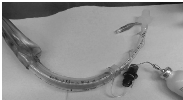
FIGURE 1. Cetacaine Spray being used as a lubricant with an intubating laryngeal mask airway.

adverse effect. It should be noted that methemoglobinemia occurs from oxidation of the iron molecule, within hemoglobin, from its normal Fe^{2+} state to an Fe^{3+} state. It is this oxidized Fe^{3+} state that causes hemoglobin to lose its ability to bind oxygen. Moreover, it is the benzocaine component of Cetacaine that is specifically responsible for this adverse effect. 7 Cetacaine is commercially available in either a spray or gel form, and both formulations contain benzocaine. Likewise, other topical local anesthetics also contain benzocaine.